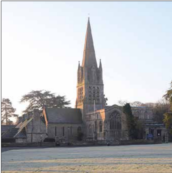
Fig. 1 Grade-I Listed church of St Mary, Witney

Listing gives statutory protection to buildings of special architectural or historic interest. It protects these buildings from unauthorised alteration or demolition. The Listing of buildings of special architectural or historic interest is the responsibility of Historic England; however, all planning matters relating to Listed Buildings are the responsibility of the District Council.