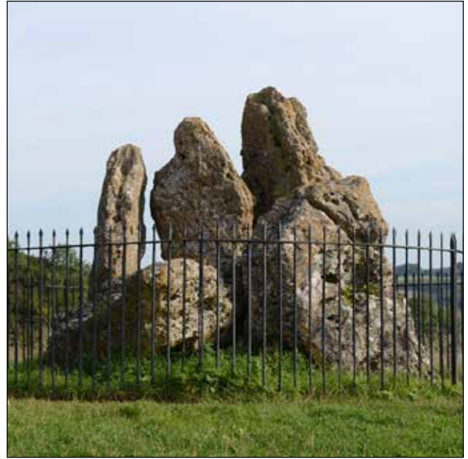
Fig. 6 Rollright Stones Scheduled Monument

In West Oxfordshire there are 142 Scheduled Monuments, including well known sites such as the Rollright Stones and Minster Lovell Hall; together with comparatively recent monuments, such as the