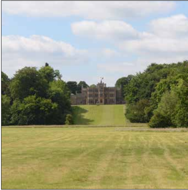
Fig. 5 Rousham House and Park

As well as being protected by various other landscape designations, the park is home to 45 structures Listed at Grade-I or Grade-II*, together with five Scheduled Monuments. These exceptional levels of sensitivity must be appropriately reflected in any proposals that might affect Blenheim Palace, its associated structures, park or landscape setting.