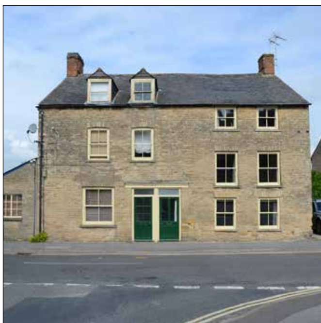
Fig 4. Locally Listed Building in Chipping Norton

The criteria for Local Listing are essentially similar to those for Listed Buildings. Identification of a Locally Listed Building entails an analysis of the architectural and historical interest of the building, its date and style, design and materials, state of preservation, and what contribution the building makes to the area. A typical Locally Listed Building might be a substantially original nineteenth-century house, of locally characteristic design and materials, whose presence enhances the character and appearance of a Conservation Area.