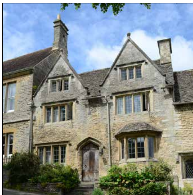
Fig. 3 Listed house in Burford

Unauthorised external or internal works entailing material change to a Listed Building constitute a criminal offence that may lead to enforcement action or prosecution, and ultimately an unlimited fine or up to twelve months imprisonment (or both). There is no time limit for this action, and liability for illegal works may pass to the new owners of a Listed Building.