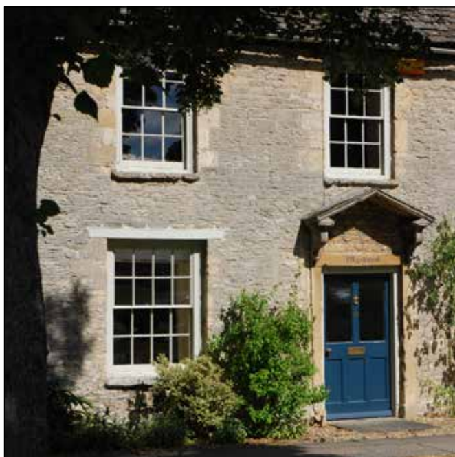
Fig. 2 Listed house in Witney

Listing covers the entire fabric of the Listed Building, inside and out and including later extensions; and may cover structures deemed to lie within the curtilage of the Listed Building, such as outbuildings or walls. Internal or external alterations, extensions or demolition all require Listed Building Consent.