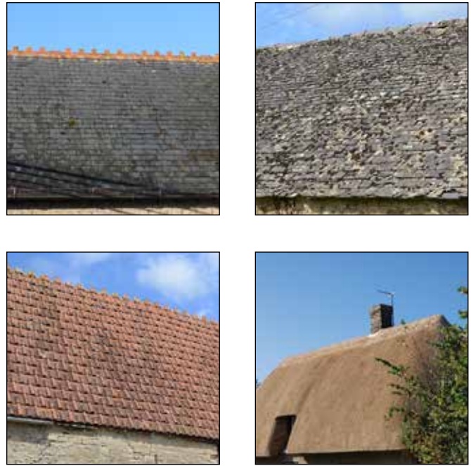
Fig. 3 Welsh slate, stone slate, clay tile and thatch

There was a range of traditional roof coverings, including thatch, stone tiles, timber shingles, clay tiles and blue slate; all usually laid on timber battens, and fixed directly to the roof structure, with no form of underlay. The more irregular coverings (particularly stone slates) were sometimes pointed-up internally with porous lime mortar (a process known as 'torching'), to help prevent wind-driven rain entering the roof. Such roofs are breathable over the whole surface, and will allow moisture from the habitable spaces below to evaporate effectively.