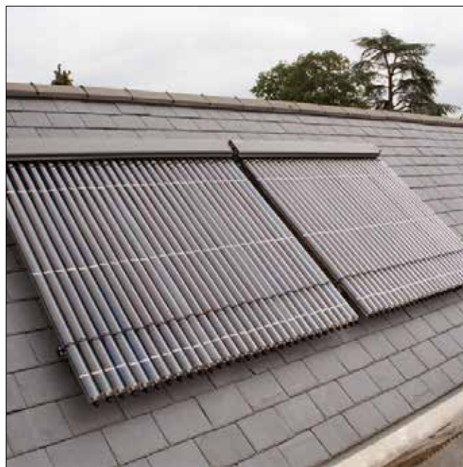
Fig. 14 Solar thermal panels (evacuated tube type)

These are externally located panels containing fluid in tubes (usually water with antifreeze), designed to absorb heat from the sun. Typically, the heated fluid is circulated through a heat exchanger in an internally located water tank, to provide hot water for domestic uses. It is possible to use these systems for air heating; although in this country this is likely to require large expanses of panels. There