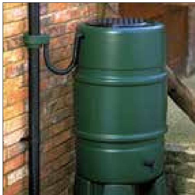
Fig. 13 Water butt for rainwater harvesting

This entails the collection of rainwater from roofing and possibly the land, for various non-potable uses, including flushing WCs, clothes and car washing, and garden irrigation. It can offer significant savings in mains water consumption (around 50% for a typical house), and so, from a climate change perspective, is eminently supportable. A rainwater storage tank