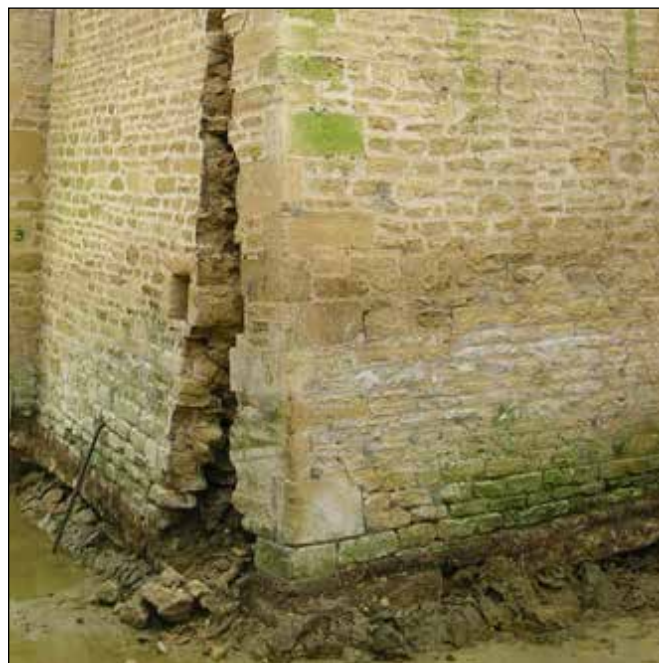
Fig. 7 Care must be taken to avoid undermining footings

As noted above, most traditional buildings in the District have a solid floor, effectively laid directly onto earth. In these circumstances owners may wish (and are often advised by surveyors or contractors) to take up the floor so that a new concrete floor can be laid on a damp-proof membrane; and, these days, a good layer of insulation – especially where under-floor heating (whether water or electric) is contemplated. Where old flagstones or other important fabric is not lost (and can be taken up and re-laid without significant physical damage or impact on its character) this is invariably sensible advice; however, on a Listed Building, where original fabric could be lost, Listed Building Consent would be required, and such work may be problematic.