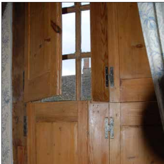
Fig. 10 Traditional wooden shutters

to add draught seals could be considered. Where shutters are absent or not original, a good case could be made for the addition of modern highly insulated shutters (as part of a fully considered package of work) in preference to any alteration to the windows themselves – except the addition of draught seals if possible.