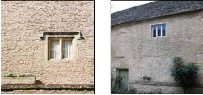
Fig. 5 Small window area in traditional houses

enclosure needs to be considered before deciding whether double-glazing would necessarily be the best use of available resources. Also, especially in the countryside, vernacular buildings were