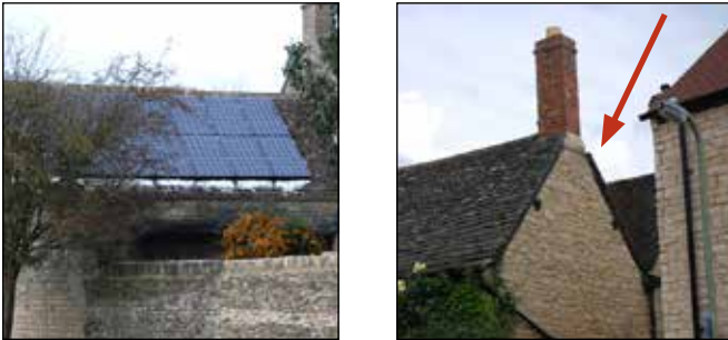
Fig. 15 Conspicuous and concealed solar panels

of the roof; and the panels do not project more than 200mm above the roof or wall surface. For freestanding arrays Planning Permission may not be needed either, depending on location, height and size.