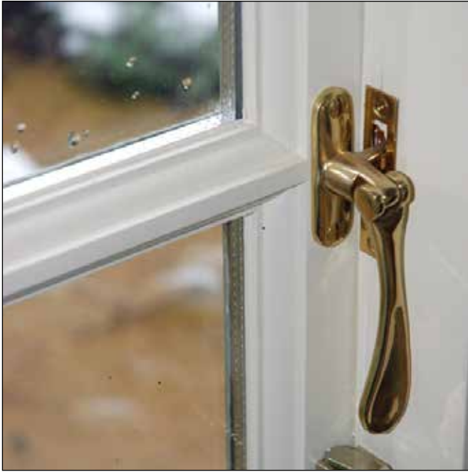
Fig. 9 Slim double-glazing with well detailed glazing bar

Government guidance used to hold that double-glazing was seldom if ever appropriate for a Listed Building. Current advice holds that the potential damage of such a change needs to be weighed against the potential to mitigate the impact of climate change. Whether single-glazed windows in a Listed Building should be replaced by double- or even triple-glazed windows, or whether some form of double-glazing should be added – will always need to be judged on a case-by-case basis; however, considerations will include: