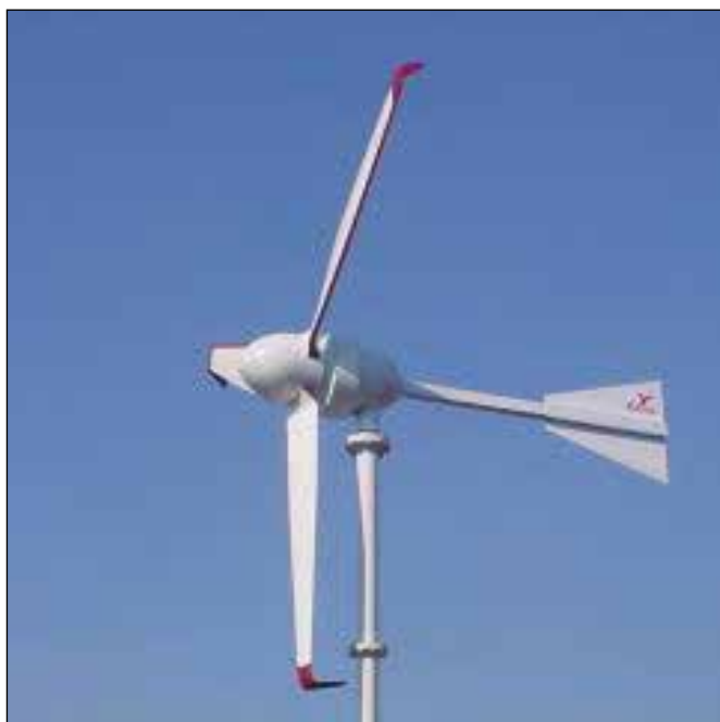
Fig. 16 Small scale wind turbine

the electricity generated can be used for domestic purposes, and any surplus potentially sold back to the grid. Typical small scale turbines range from around 0.93 metres diameter, producing up to 0.1 kW, to around 15 metres diameter, producing up to 50 kW. Smaller turbines may be building-mounted; larger turbines are usually freestanding.