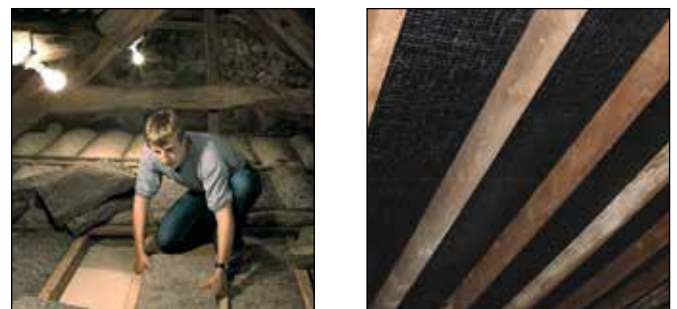
Fig. 6 Insulation can be laid between joists or rafters

The following notes relate to the main building elements where traditional construction is often judged to be inadequate by modern standards and where intervention is most frequently considered. Installing insulation to roofs is most likely to be undertaken in one of three ways: