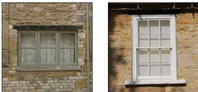
Fig. 4 Traditional casement and vertical sash windows

Earlier windows were originally glazed with handmade ‘cylinder’ or ‘crown glass’, both of which have an uneven and highly characteristic surface.