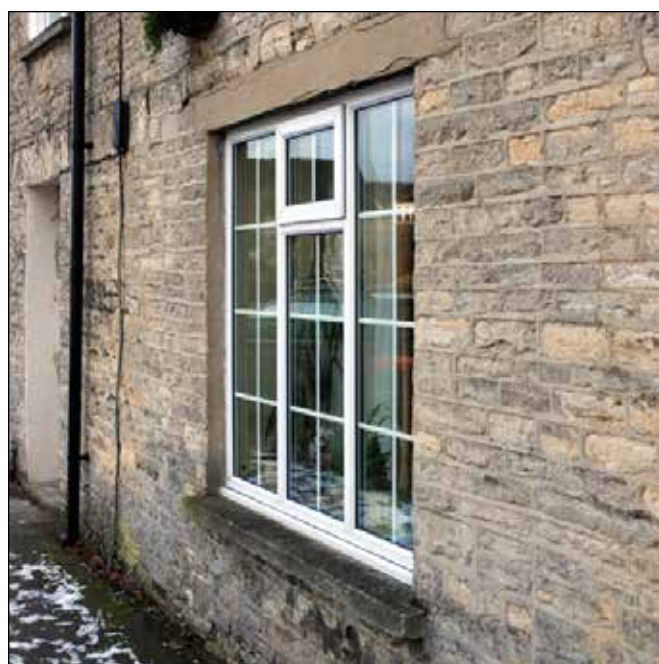
Fig. 8 Visually harmful double-glazing

Partly as a result of advertising by window replacement companies, many people believe double-glazing is one of the most effective ways to save energy in their homes. However, as noted above, the proportion of heat lost through the small area of window openings in traditional buildings is often significantly smaller than that lost through other elements of construction – most notably the roof.