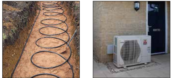
Fig. 12 Ground source pipework and air source heat pump

Ground and water source heat pumps have two primary components: 1) the heat collecting pipework, which allows a mixture of water and anti-freeze to flow through the heat source; 2) the pump unit, which circulates this mixture and which collects heat from it. Pump units tend to be larger than typical heating boilers, although can usually be fitted into typical domestic spaces. With relatively small bore pipework, installation is unlikely to be problematic.