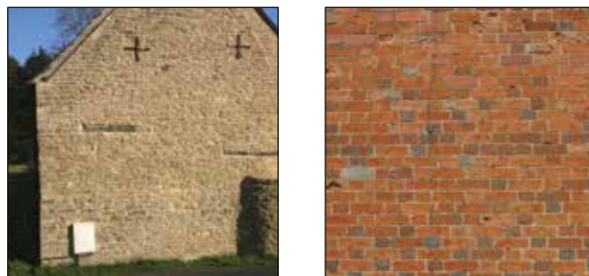
Fig. 1 Local limestone and clay brick walling

From the C19 onwards, walls have usually been built with a damp proof course – a continuous layer of some impervious material, such as lead, slate or bitumen, set just above external ground level. This separates the lowest part of the wall from the upper part, and prevents moisture from the ground passing up into the parts of the wall that are within the internal rooms.