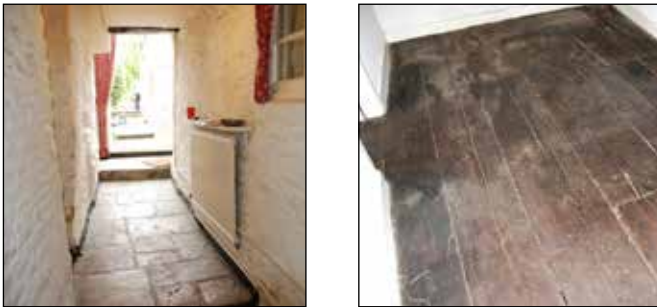
Fig. 2 Traditional stone flag flooring and elm boards

sand or ash base. Modern, solid ground floors are usually of concrete, with damp proof membranes (usually impermeable plastic sheeting) separating the floor surface from the ground; they may also have insulation beneath or within the floor structure. Traditional solid ground floors do not have insulation or damp proof membranes; as with traditional walls, they rely on their mass and the breathability of the construction to allow moisture to evaporate.