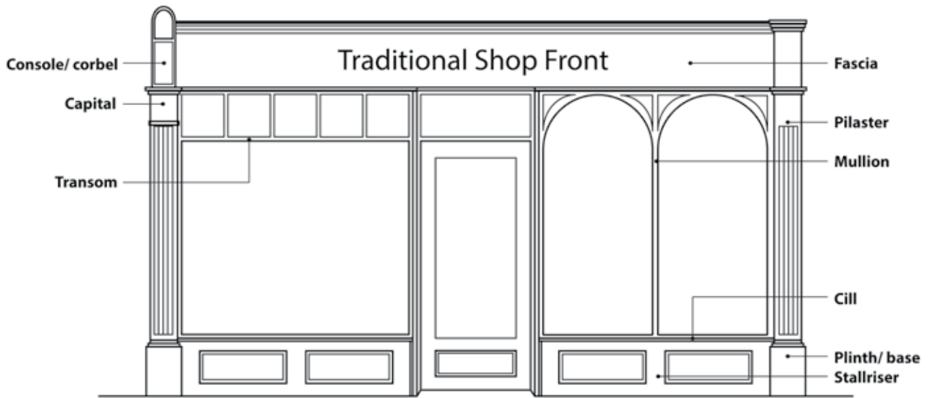
Fig. 5 The components of a traditional shop front