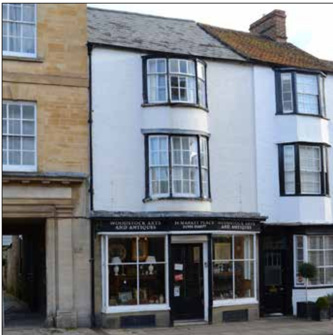
Fig. 3 The shop front should respect the overall elevation

Another fundamental aspect of context to consider is the character of the building. Is the building traditional or modern, vernacular or high status, humble or imposing? What date or period does it belong to? (for example, Georgian, Victorian or twentieth-century?)