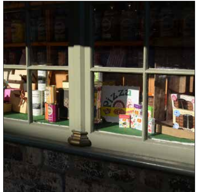
Fig. 11 Particular care should be taken with window displays

Shop windows should not be obscured by a proliferation of stickers or posters. The internal illumination of the window display should also be carefully considered: subtle, focussed lighting of the goods being displayed can greatly enhance a window display; while harsh, overly bright or unvarying illumination can undermine it.