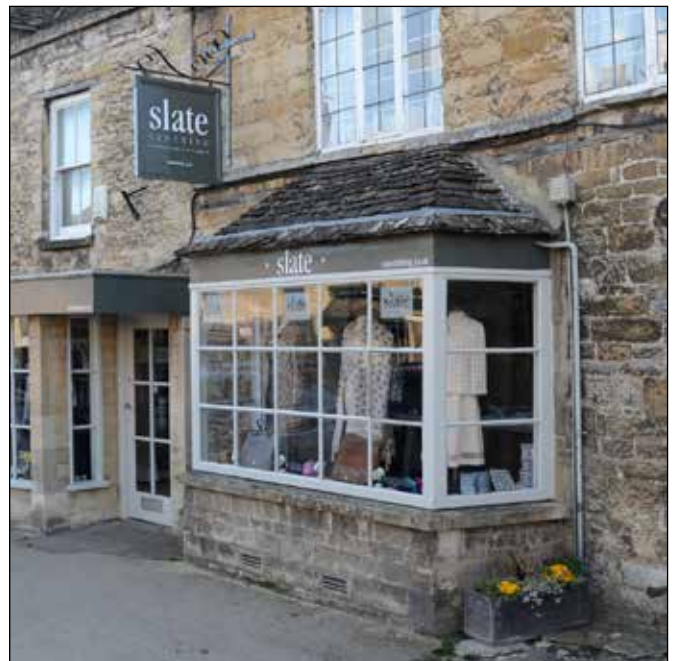
Fig. 10 Signage should be proportionate and in keeping

The purpose of shop front signage is primarily to inform shoppers of the name and nature of the business. It is important that this information and its display is carefully considered, proportionate and appropriate to its context.