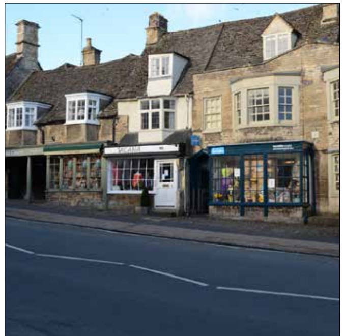
Fig. 4 Variety characterises traditional high streets

Where the buildings vary in date and design along a street or in an area (and are not uniform) the shop fronts, too, should vary in their composition and design. It is more important that a shop front relates well to the specific building elevation of which it is a part, than conforms artificially to the design of nearby shop fronts belonging to fundamentally different buildings. Vibrant, traditional high streets are generally characterised by the richness and variety, and not the uniformity, of their shop fronts.