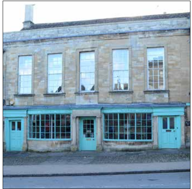
Fig. 8 Windows and doors should relate to the elevation

Fenestration and doorway/s should relate meaningfully to the elevational context, particularly in terms of the character and composition of the elevation. The height of the window is generally governed by the size of the structural opening. The visual proportions of the glazing are generally greatly improved if it has a vertical emphasis (the individual panes taller than they are wide) – this can be achieved through the use of mullions to subdivide the glazing.