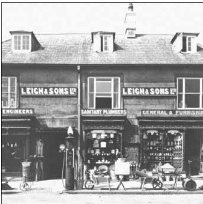
Fig. 1 Leigh & Sons in Witney c.1900

Where an historic shop front survives, this should be preserved or restored – particularly if it forms a part of a Listed Building. Where a historical