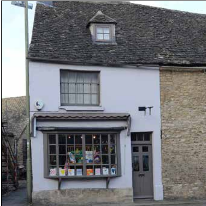
Fig. 9 The consistent use of colour

Perspex) are not generally appropriate for shop fronts in historical contexts, being conspicuously modern materials that tend to look out of place on historic buildings.