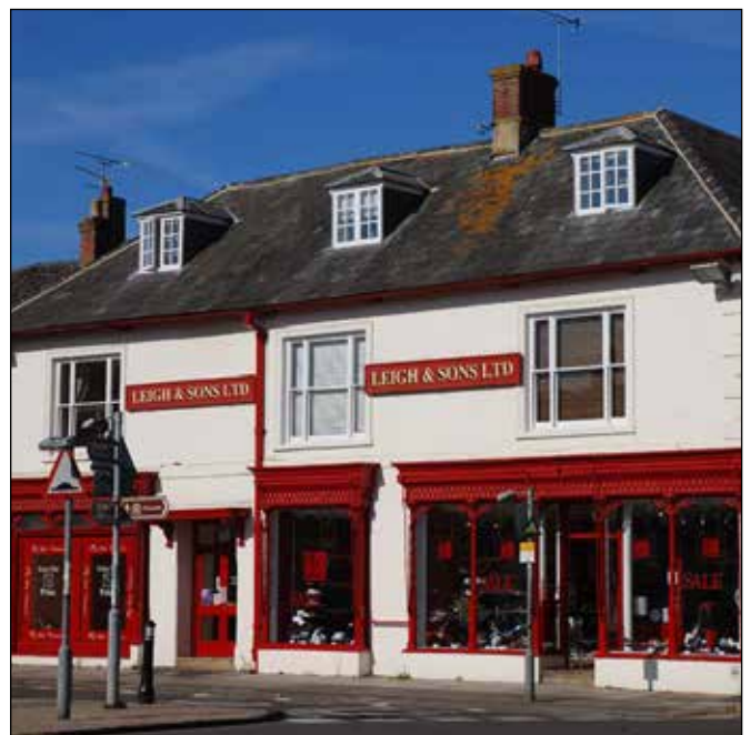
Fig. 2 Leigh & Sons c.2000